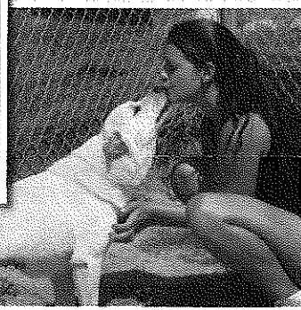
Before in the dog meat slaughterhouse, and now in a loving home

Sanctuary in Mississippi. Kurt, Paul and Valencia, three of the original Slaughterhouse Five, have now been adopted and are now enjoying a new lease on life.